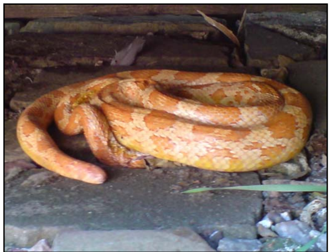
Corn Snake in a Harlow garden

Corn snakes, also known as red rat snakes, are a large, powerful, and non-venomous constrictor in the genus Elaphe . All the species in these taxa are medium to very large size Colubrids that feed on rodents and other small prey. All snakes, including the corn snake, have been persecuted by man out of justifiable fear but also ignorance. The corn snake is a prime example of this latter case, as they are often killed because they resemble a copperhead (a very venomous species).