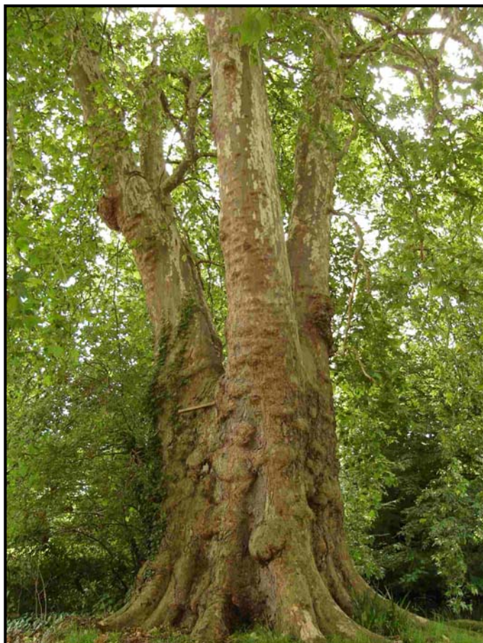
Huge London Plane in the Passmores House garden

If you have a huge veteran tree near you why not take a picture and email it to us and a selection of the best will go in each months newsletter.