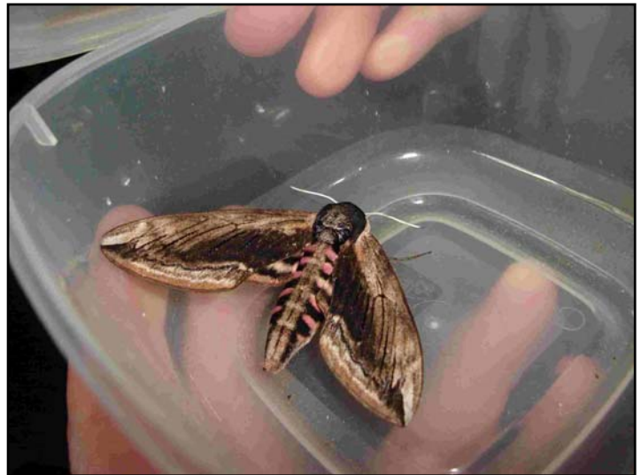
Privet Hawk Moth

Our largest resident hawk-moth, which is distributed in the southern half of Britain, and has distinctive pink and black barring on the body. This one flew into the office through an open window.